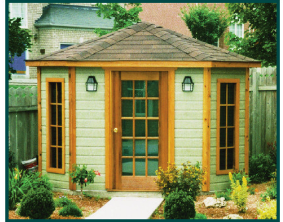
Item 605- 10ft in Canexel Acadia Lights not included