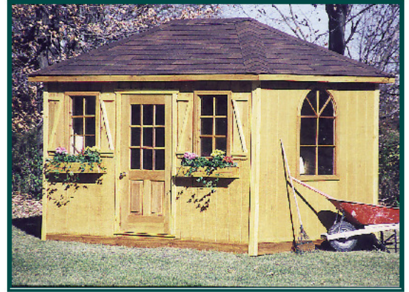
8x12 Milan in T 1-11 (extra arch window shown)