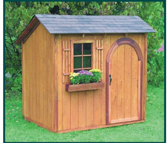
Item 108 - 6x8 Chesapeake (T 1-11 -stained -paint/stain not included)