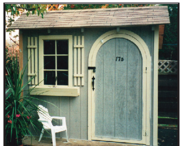
6 x 8 Stained Blue and white (not incl.)