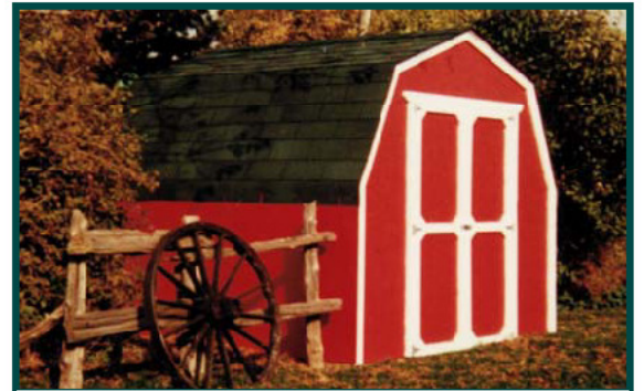
Item 500 - 8x8 Raven (Painted red w/white trim)

Floor kits: Available as a special order item or ask a store representative for simple instructions to build your own.