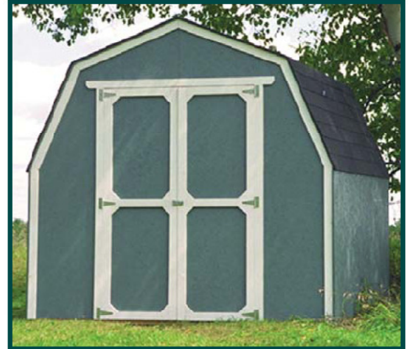
Item 500 - 8x8 Raven (Painted blue w/white trim-paint/stain not incl.)