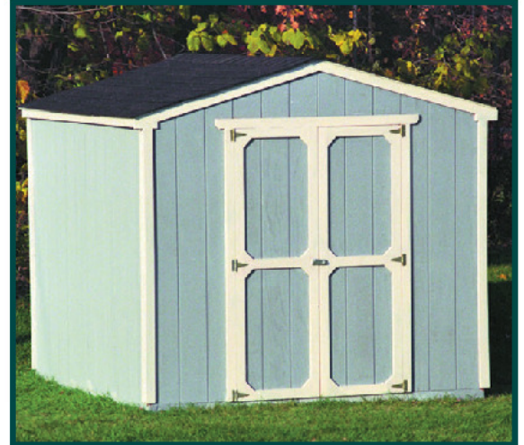
Item 508 - 8x8 Ranger

(Painted Blue w/White Trim-paint/stain not incl.)