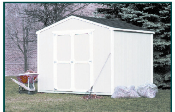
Item 508 - 8x8 Ranger

(Painted Grey w/White Trim-paint/stain not incl.)