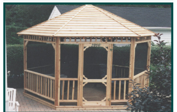
12 ft. Rosewood w/extra screen kit