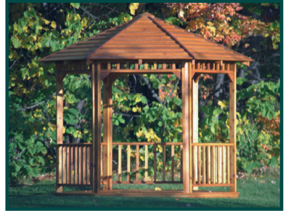
Item 831 - 8 ft. Rosewood